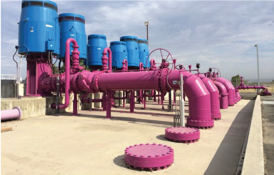
Recycled Water / Purple pipe.